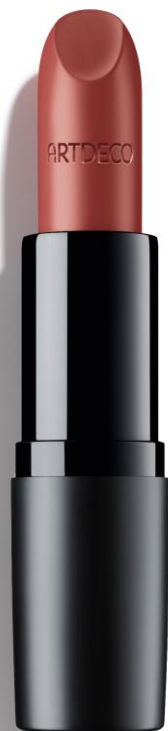
N°190 true love