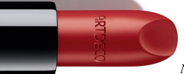
N°230 red a porter